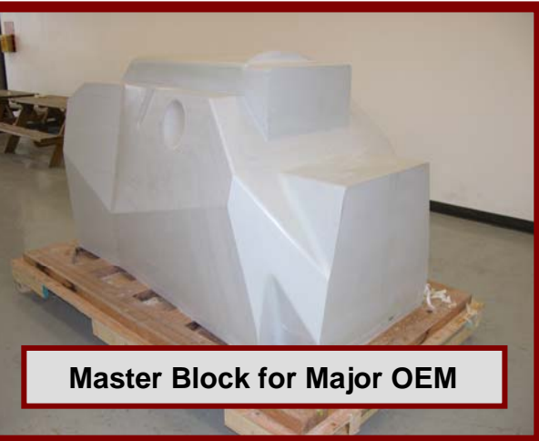
Master Block for Major OEM