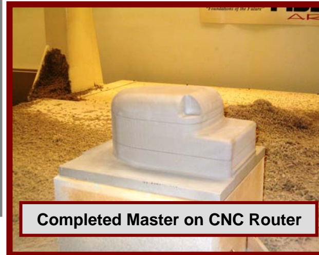
Completed Master on CNC Router