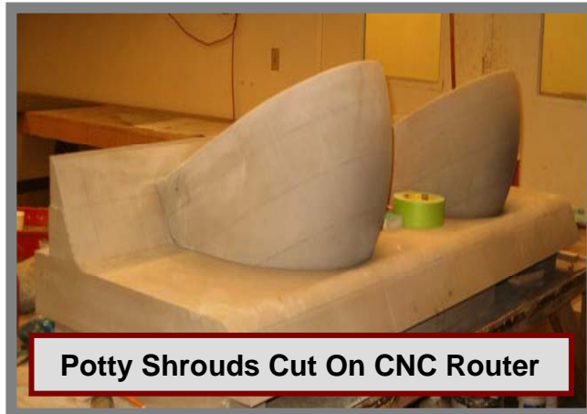
Potty Shrouds Cut On CNC Router