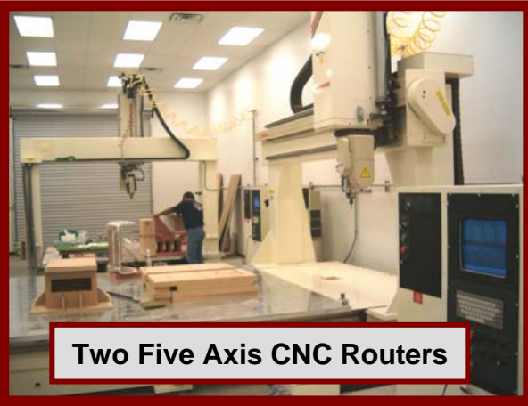
Two Five Axis CNC Routers