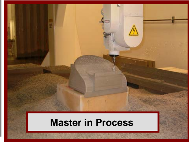
Master in Process